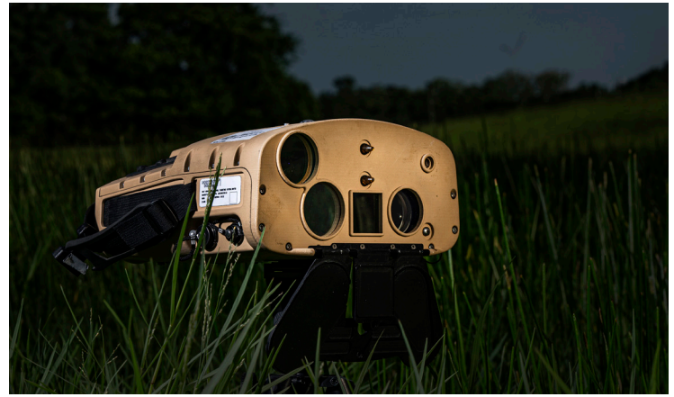
Incorporated into Marine Corp NGHTS handheld.