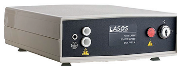
Laboratory power supply (SAN series)