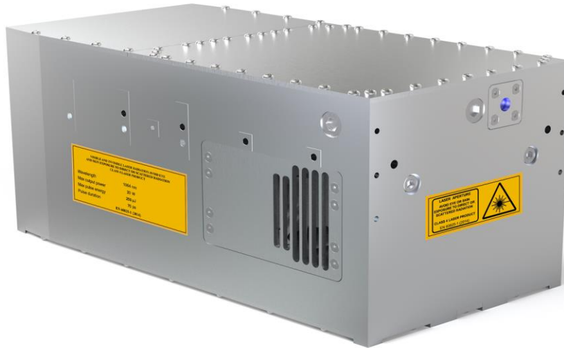
Figure 1: Lampo laser head including driving electronics and air cooling fans.

Bright Solutions is glad to introduce Lampo , the new family of compact ultrafast lasers generating high peak power ps laser pulses at a repetition rate selectable over a wide frequency range, externally triggerable from 50 kHz to 4 MHz.